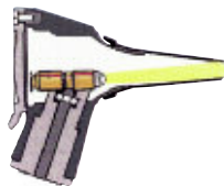
Direct XHL Xenon Halogen illumination

HEINE mini 3000® pocket instruments – a complete range of quality diagnostic instruments for your pocket. Available in black or blue. Please specify the colour you prefer when ordering. If not otherwise specified, we will supply black instruments.